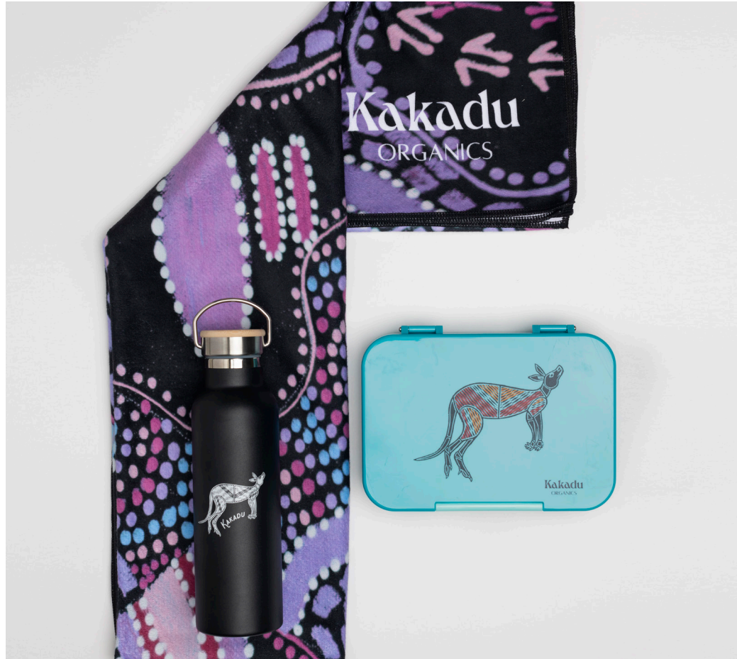
PRODUCT: CUSTOM LUNCHBOX, WATERBOTTLE AND MAT